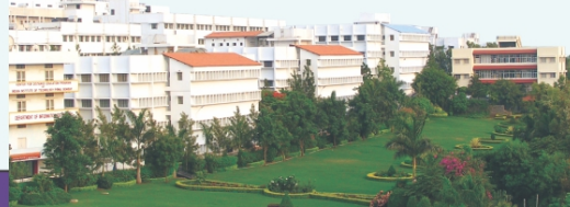
Mehta Creations - 24002340